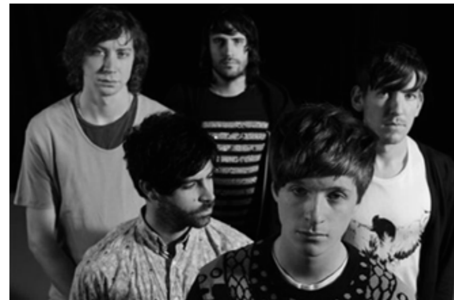
Foals are playing at the Palace Theatre on 10 February