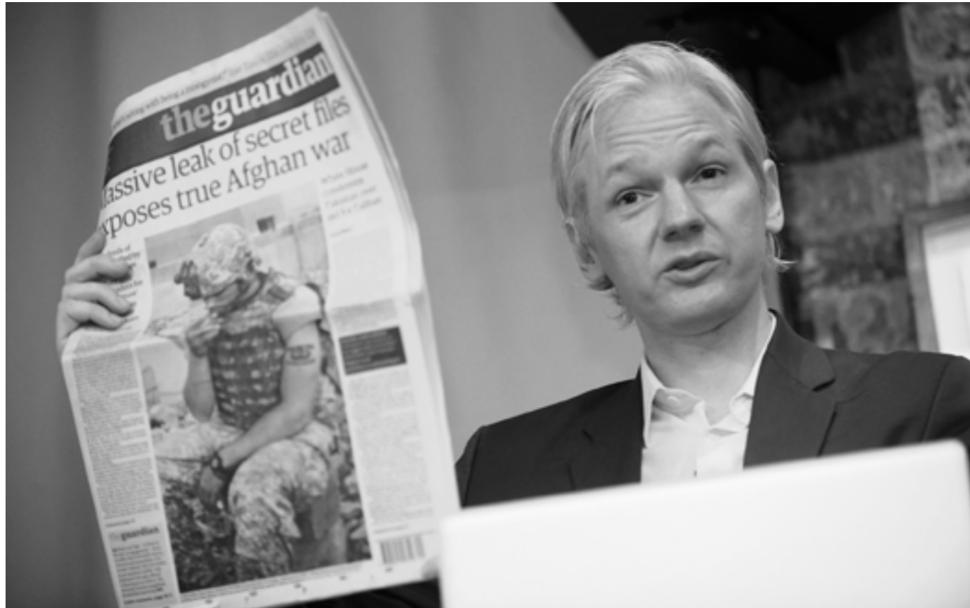
Wikileaks founder Julian Assange has attracted his fair share of headlines.