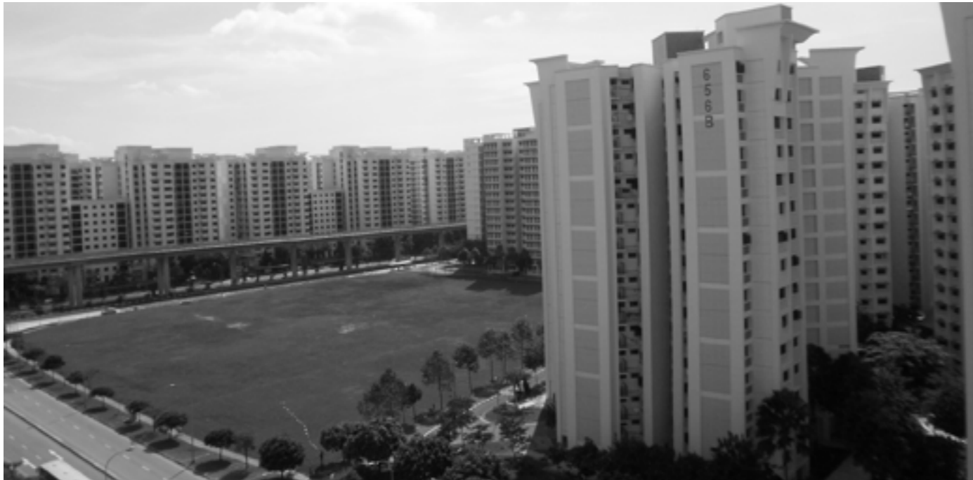
Jurong West – a quintessential Singaporean neighbourhood.