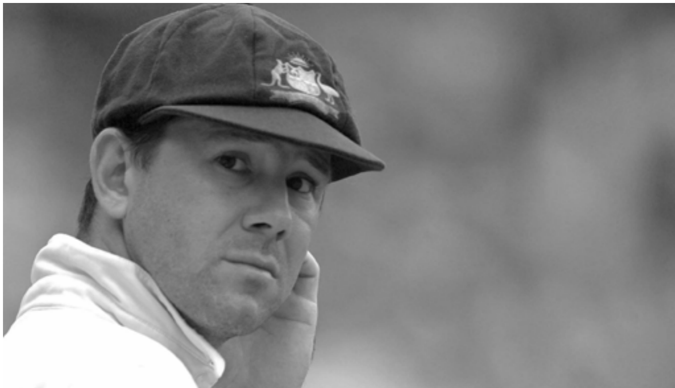
Australian captain Ricky Ponting had a shocking Ashes series, averaging just 16 from eight innings. Is it time for 'Punter' to call it a day?