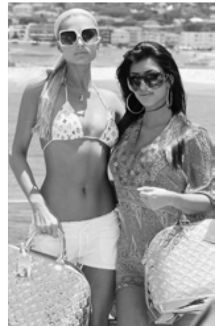
Should Paris and Kim be turning to Julian Assange for PR advice?

Many media companies have actively cooperated with